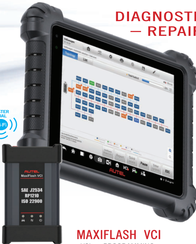
MAXIFLASH VCI VCI + PROGRAMMING