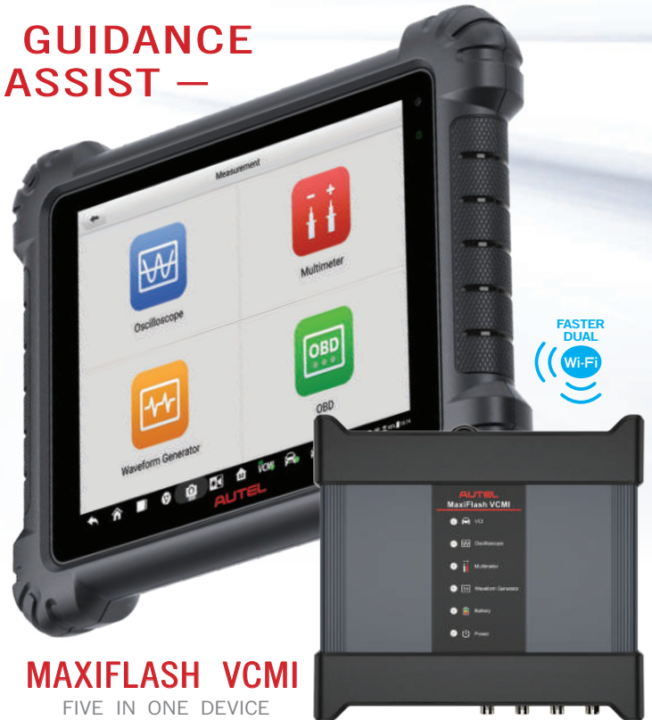
MAXIFLASH VCI FIVE IN ONE DEVICE